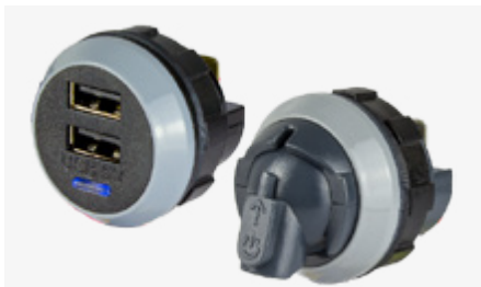
PowerVerter USB PVPro-D and PVPro-L

This causes the dilemma. Lights on or off? At night, typically lights are dimmed and passengers can choose a private reading light, usually situated in the ceiling of the vehicle which then shines on the appropriate seat, illuminating their surroundings. However, to reach from the ceiling, such lights need to be quite bright. This can cause annoyance to nearby passengers, as well as a significant rear view distraction to the driver as lights flash on and off while the vehicle is in motion. The Alfatronix PVPro-L reading light offers the ideal solution. It can be installed in the back of the seat in front. The light ray can be directed to the left or right as well as forward or backwards for discreet, yet maximum comfort for both the user and their neighbours.