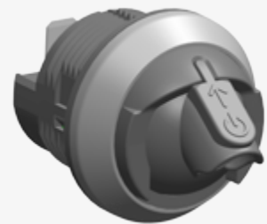
Directable personal lighting, easy to switch on and off.